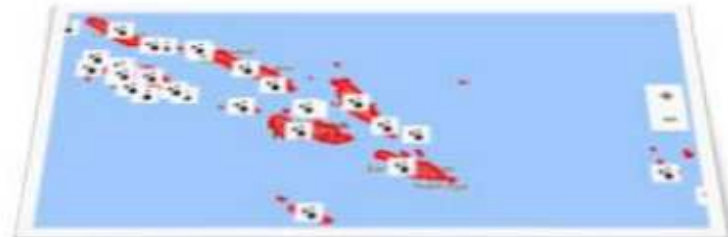
Heavy rain warning – SmartMet Alert